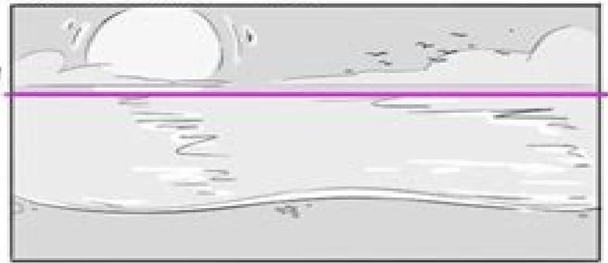
Horizon line high