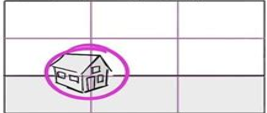
Adding a point of interest