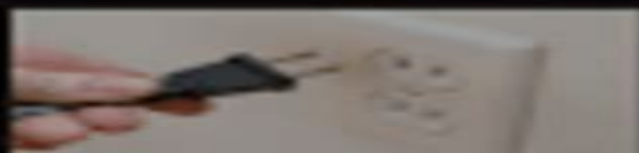
Lamp Switch Replacement