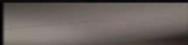
Superficial Drywall Ceiling Crack Repair