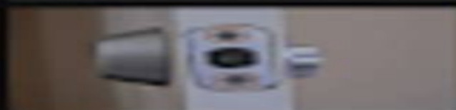
How to Fix a Sticking Deadbolt