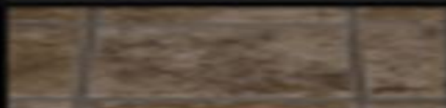
How to Replace Cracked Tile