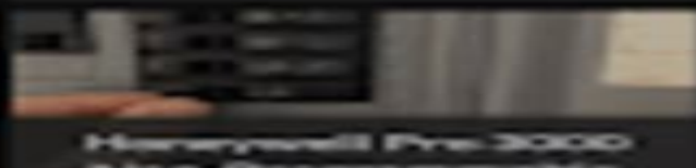
Honeywell Pro 3000 Non-Programmable Thermostat Replacement