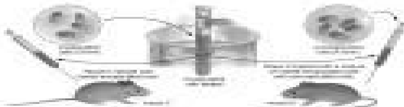
Figure 39 Griffith's experiment