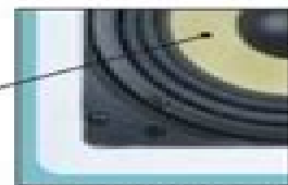
Woven Kevlar Cone with Rubber Surround