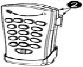
Figure 2 - Mounting

Replace battery (verify proper polarity) and close cover