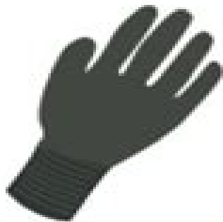
Gants anti-coupure & égouts D