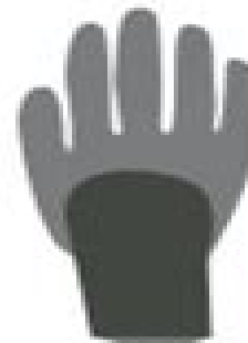
Gants béton projeté (usage unique)