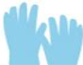
Gants produits (usage unique)