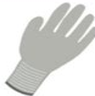
Gants anti-coupure (mi saison) D