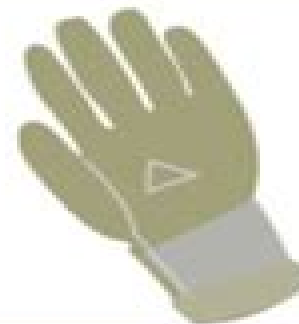
Gants manutention (hiver) B