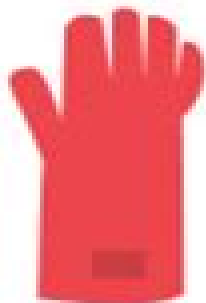
Gants travaux soudure D