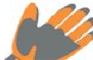
Gants matériels vibrants (usage unique)