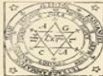
Pentacle de Salomon