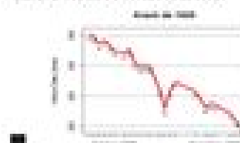
L'indice Dow Jones pendant le krach de 1929

La faillite des banques américaines entraîne celle des banques d'Europe et d'Amérique.