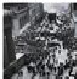
La foule se presse devant la Bourse après le krach

On doit noter l'effacement progressif à la même période. Les investisseurs sont avant tout les agents qui ont le plus de difficulté à collecter les fonds. (Le 28 octobre 1929, dit le « crash », le panique s'empare de la bourse de New York et des millions de titres changent de mains. Cinq jours plus tard, l'effacement est complet par la venue de plus de millions de titres. L'indice Dow Jones perdant le krach de 1929)