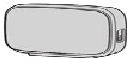
KX-TGP600G/ KX-TGP600CEG/ KX-TGP600UKG