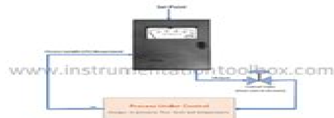
Controller Loop for a Pneumatic Controller

The Foxboro 43AP pneumatic controller is a versatile process instrument controller that can be used to control pressure, temperature, flow and level. As with all process controllers, the Foxboro 43AP pneumatic controller continuously detects the difference between a process measurement and its set point, and produces an output air signal that is a function of this difference and the type of control.