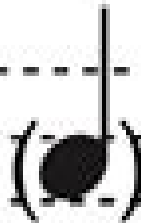
Ghost note drum technique