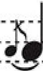
Flam drum technique