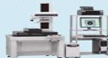
SV-3000C NC + QVP