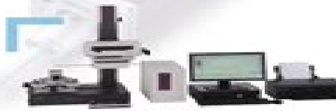
CV-3200 / CV-4500