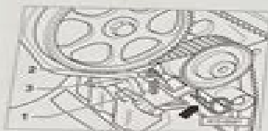
Removal and installation of timing belt and belt tensioner. 1.8 Cylinder Head (1.8 Liter Engine)