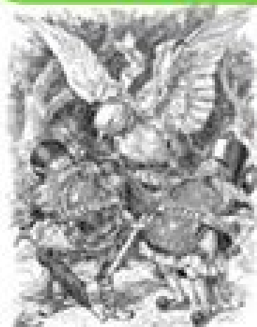
MILITARY FOR MURDER.