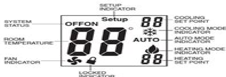
Fig. 1 — Thermostat Display

MODE BUTTON OPERATION — The Mode button selects the operating mode of the thermostat. If OFF is selected, the thermostat will not enter Heating or Cooling mode. If HEAT is selected, the thermostat will only enter Heating mode (if the room temperature is below the heating set point). If COOL is selected, the thermostat will only enter Cooling mode (if the room temperature is above the cooling set point). If AUTO is selected, the thermostat will enter Heating or Cooling mode based on the room temperature and the heating and cooling set points.