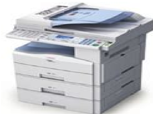
Aficio® MP 201SPF