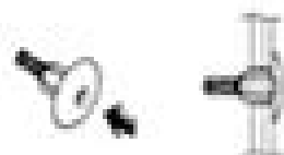
Abb. 11 Sattelstütze Sattelstütze