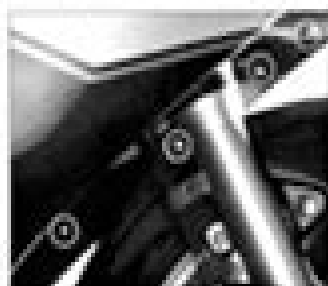
Abb. 14 Sattelstütze Sattelstütze