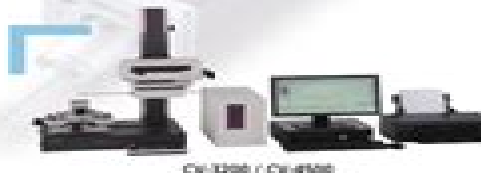
CV-3200 / CV-4500