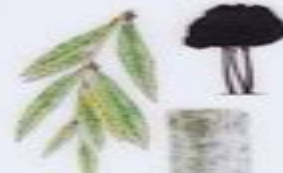
Pacific Waxmyrtle Myrica californica D 1"; H 30" LV 2"-4" L x 0.75" W; R 0"-500