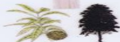
Golden (Giant) Chinquapin Castanopsis chrysophylla D 1"-3"; H 60"-100" LV 2"-5" L x 1.5" W; R 1"-6000"