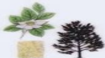
Pacific Dogwood Cornus nuttallii D 1"; H 50" LV 2.5"-4.5" L x 1"-2.5" W; R 0"-6000"