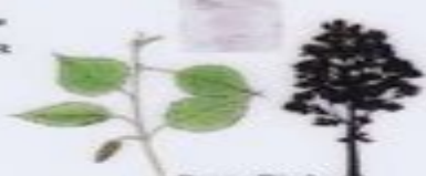
Paper Birch Betula papyrifera D 24"; H 100" LV 1.5"-3" L x 2" W; R 0"-5000"