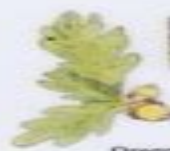
Oregon White Oak Quercus garryana D 1"-3"; H 30"-60" LV 3"-6" L x 2"-4" W; R 0"-5000"