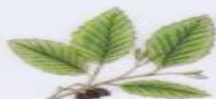
Red Alder Alnus rubra D 2"; H 50"-100" LV 3"-5" L x 2"-3" W; R 0"-2500"