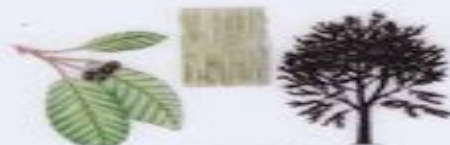
Castanea Buckthorn Rhamnus parviflora D 1"; H 30" LV 2"-6" L x 1"-2.5" W; R 0"-5000"