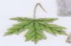
Bigleaf Maple Acer macrophyllum D 3"-4"; H 30"-70" LV 6"-10" L x 6"-10" W; R 0"-10,000"