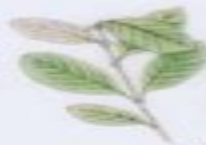
Scouler Willow Salix scouleriana D 1"-2"; H 20"-50" LV 2"-5" L x 0.5"-1.5" W; R 0"-10000"