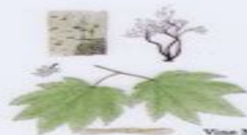
Vine Maple Acer circinatum D 8"; H 25" LV 2"-4" L x 2"-4" W; R 0"-5000"

C—Cone D—Diameter H—Height LV—Leaves LV—Length N—Needles R—Range W—Width