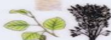
Water Birch Betula occidentalis D 6"-12"; H 30" LV 1"-3" L x 1" W; R 2000"-8000"