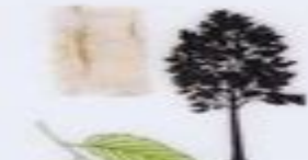
White Alder Alnus rhombifolia D 2"; H 60" LV 2"-3.5" L x 1.5"-2" W; R 0"-5000"