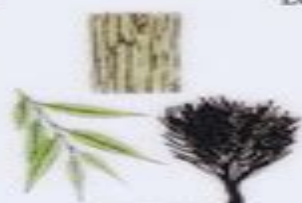
Pacific Willow Salix lasioandra D 2"; H 30"-50" LV 2"-5" L x 1" W; R 0"-8000"