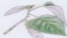
Black Cottonwood Populus trichocarpa D 1"-3"; H 60"-120" LV 3"-6"; R 0"-9000"