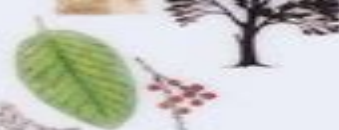
Pacific Madrone Arbutus menziesii D 1.5"; H 60" LV 2"-6" L x 1"-2.5" W; R 0"-5000"