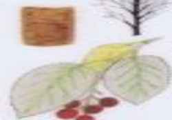
Common Chokecherry Prunus virginiana D 6"; H 20" LV 1"-3" L x 0.5"-1.5" W; R 0"-8000"