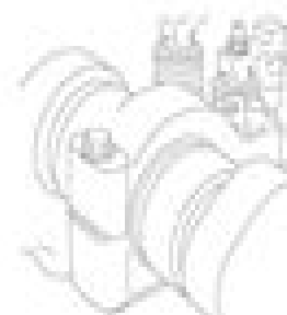
Camshaft Bearing Bracket installed

Note: Camshaft bearing journals are numbered 1-7, with matching upper and lower halves. Be sure to note and mark the corresponding journal numbers and install them in the correct sequence with matched upper and lower halves.