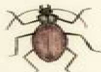
Boat-backed Beetle 20 mm F: Insects, Grubs, Larva H: Soil, Lawns