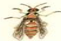
Paper Wasp 25 mm F: Larva eats insects H: Throughout N. America