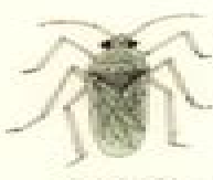
Dandelion Bug 12 mm F: Aphids, plant bugs H: Gardens, Meadows