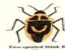
Two-spotted Stink Bug 12 mm F: Caterpillars, Larva H: Meadows, Crops, Gardens