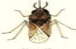
Big-eyed Bug 8 mm F: Aphids, small insects H: Meadows, Gardens