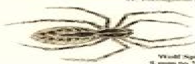
Wolf Spider 5 mm to 20 mm F: Insects H: Throughout N. America