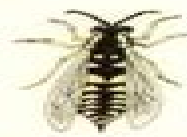
Yellow Jacket 14 mm F: Larva eats insects H: Throughout N.A.