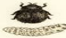
Black Ladybug & Larva 4 mm F: Aphids, small insects H: Foliage