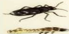
Tiger Beetle & Larva 20 mm F: Small insects H: Sandy areas, Forest edges