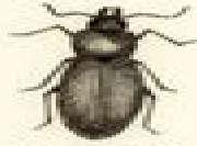
Common Black Ground Beetle 16 mm F: Grubs, Caterpillars, Insects H: Gardens (moist areas)