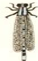
Chrysopa Fly 14 mm F: Soft-bodied insects H: Ponds, Lakes