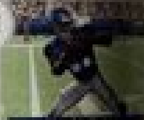
Getting Acceleration Action Jammed

Stewart lines up in the slot here, potentially causing some confusion for the defense. At the snap, he'll cross the field from left to right as Shockey cuts right to left. With two top threats cutting through the same area, the defense will be on its heels. Not Stewart for a repeat game.