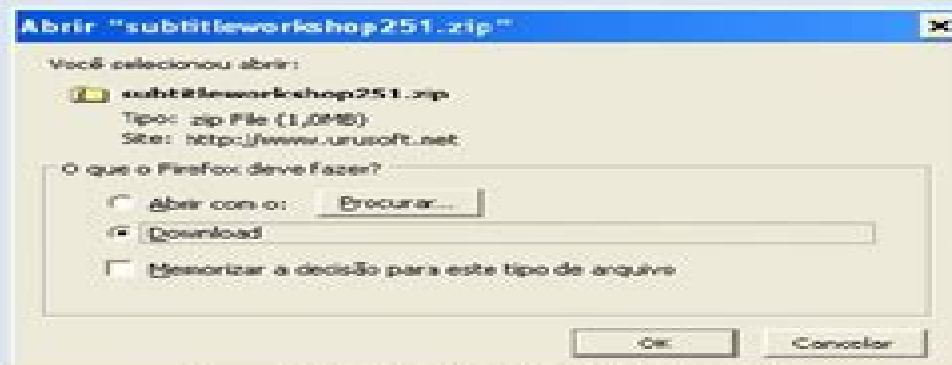
Figura 1. Download Subtitle Workshop 2.51

mirror 1 . Será exibida a seguinte janela.