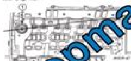
Fig. 46 Distributor Drive Shaft Slot 1 - DISTRIBUTOR DRIVE SHAFT 2 - DISTRIBUTOR HOUSING 3 - NUT