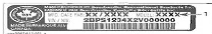
1. Model number

The Vehicle Model Number is scribed on vehicle description decal.