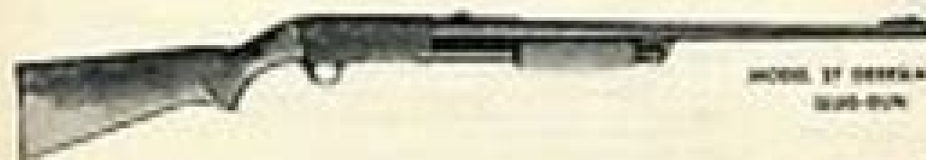
ITHACA VENT. GRADE REPEATER MODEL 37