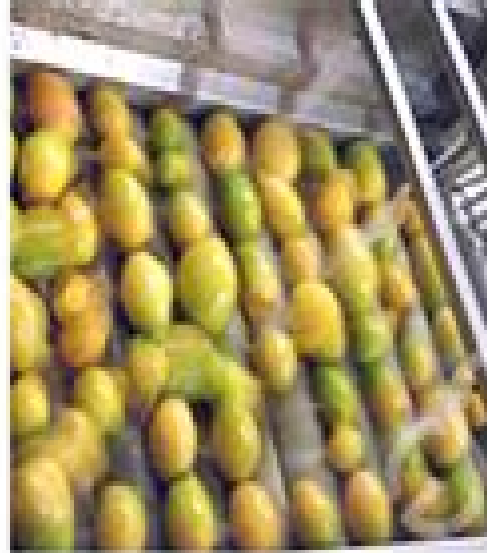
2. LAVAGE DE MANGUE