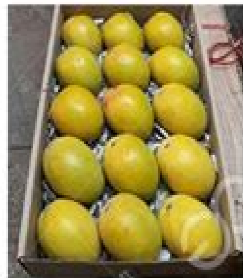
6. EMBALLAGE DE MANGUE