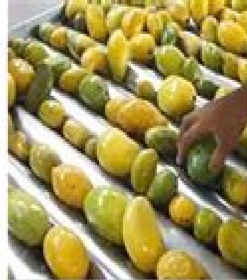
3. SÉLECTION DE MANGUE