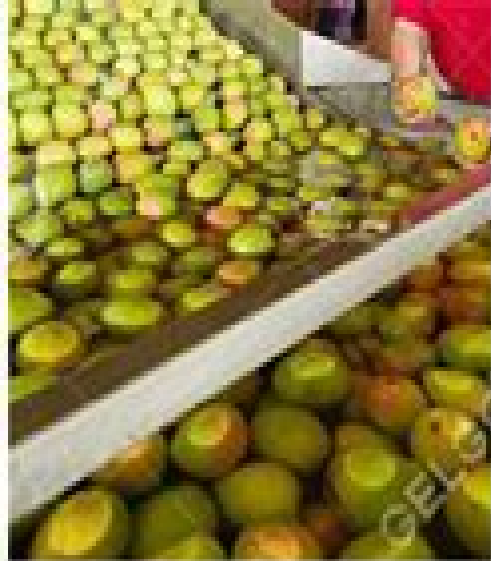
1. TREMPAGE DE MANGUE