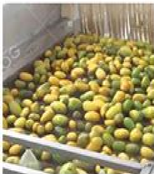
4. CIRE DE MANGUE