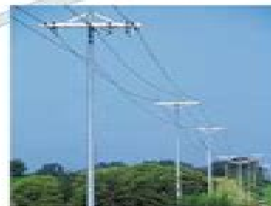
Figure. 2 showing monopole