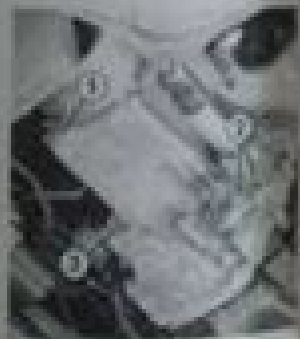
Figura 1. Desmontaje de la caja de velocidades.

Desmontaje de la caja de velocidades: 1. Desmontar el eje de transmisión. 2. Desmontar el rodillo de transmisión. 3. Desmontar el rodillo de transmisión. 4. Desmontar el rodillo de transmisión. 5. Desmontar el rodillo de transmisión. 6. Desmontar el rodillo de transmisión. 7. Desmontar el rodillo de transmisión. 8. Desmontar el rodillo de transmisión. 9. Desmontar el rodillo de transmisión. 10. Desmontar el rodillo de transmisión.