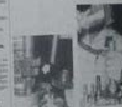
Figura 2. Montaje de la caja de velocidades.