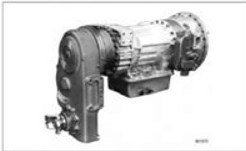
Figure 2. CLBT 750/754D8 Remote Mount