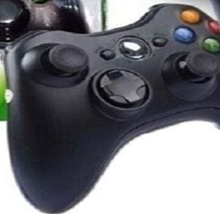
Kit Xbox 2 Controle sem fio