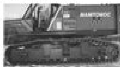
111-10 Boom Support