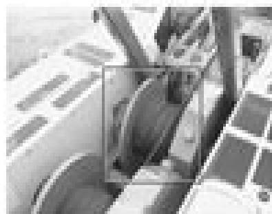
111-09 Boom Support