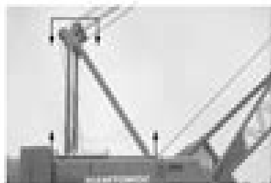
111-06 Boom Support