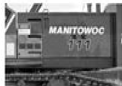
111-12 Boom Support