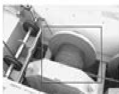
111-11 Boom Support