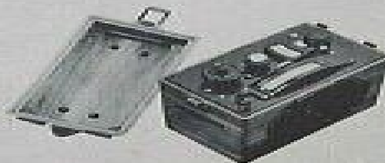
PORTABLE POTENTIOMETER SERIES 300