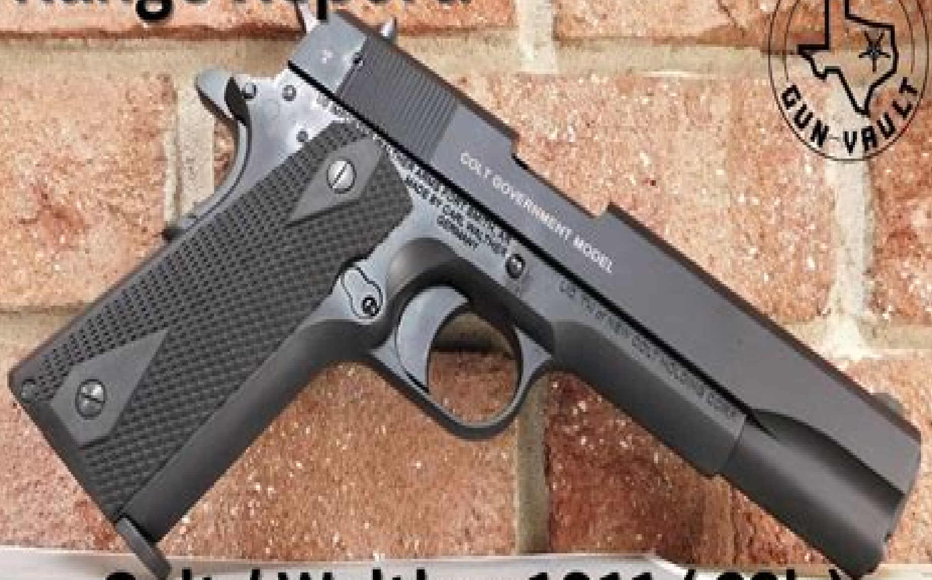
Colt / Walther 1911 (.22lr)