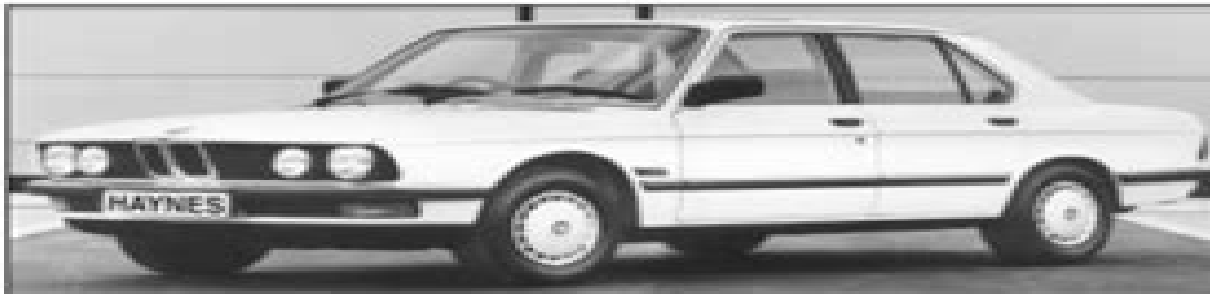
BMW 518i (E28)