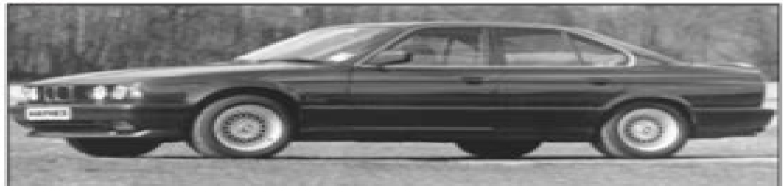
BMW 535i (E28)