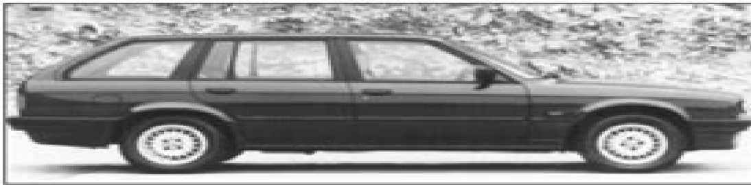
BMW 325i Touring (E30)