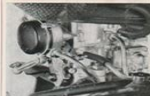
A VOILE DE DÉPART AUTOMATIQUE ET POMPE DE REPRIS