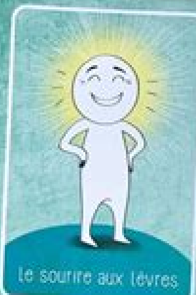
Le sourire aux lèvres