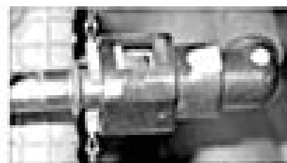
13 13a The fuel pump fitting, remove both nuts with your fingers, then pull the fuel pipe and the fitting apart

12 12d Press against the chain tensioner and disengage the specified that the chain is the same in being removed (see Illustration ).