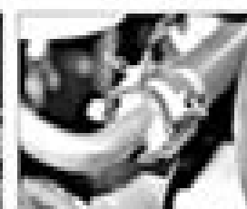
13 13k The fuel pump fitting, hold the delivery portion of the fitting, pull it out the fitting and pull the fuel pipe off the pipe