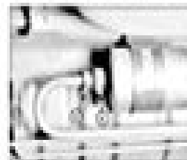
13 13c The fuel pump fitting, hold the delivery portion of the pipe or component (if applicable) and remove the pump and (if applicable) the fuel pipe