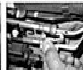
13 13e The fuel pump fitting, remove the fuel pipe of the fitting, then pull it off the fuel pipe and disengage the other end from the fuel pipe of the fitting