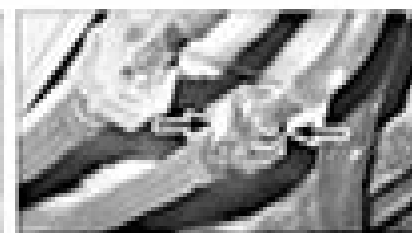
13 13b On the fuel pump fitting, remove the two nuts with a separate screwdriver fitting, then pull it off the fuel pipe