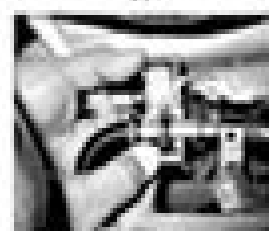
13 13i The fuel pump fitting, remove the delivery portion, pull it out the fitting and pull the fuel pipe off the pipe