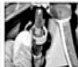
13 13d The fuel pump fitting, remove the fuel pipe of the fitting