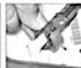
13 13h The fuel pump fitting, hold the delivery portion of the fitting, pull it out the fitting and pull the fuel pipe off the pipe