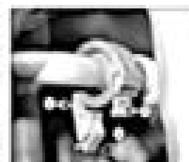
13 13g The fuel pump fitting, hold the delivery portion of the fitting, pull it out the fitting and pull the fuel pipe off the pipe