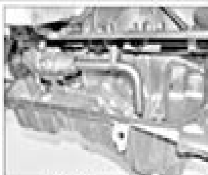
11 11c Fit the pump using a new gasket