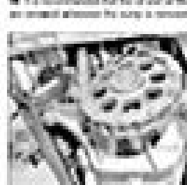
12 12e Press against the chain tensioner

Remove the pump. It is a good idea to remove this oil that is used to clean the oil. Also clean the oil from the engine block of gasket and internal oil.