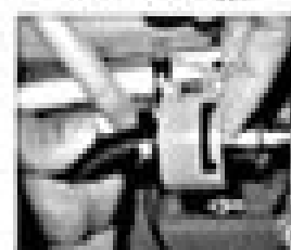
13 13j The fuel pump fitting, hold the delivery portion of the fitting, pull it out the fitting and pull the fuel pipe off the pipe