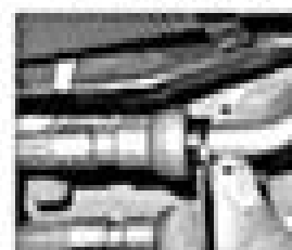
13 13f The fuel pump fitting, hold the delivery portion of the fitting, pull it out the fitting and pull the fuel pipe off the pipe