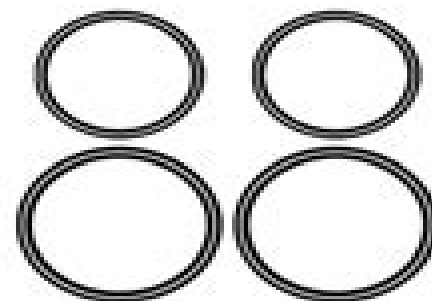
Rubber band X4