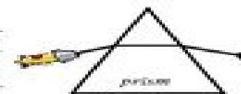
Compare laser light refracts, but does not spread out in a prism.

Lasers give off light of one particular wavelength. This comes from forcing a substance (usually a gas) to give off light. This light bounces back and forth between mirrors, causing other atoms to give off more light. When the light is powerful enough it escapes as a laser beam.