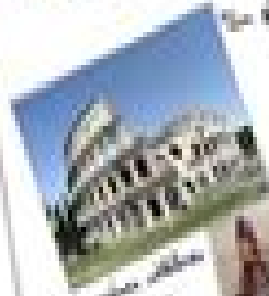
Les vestiges de l'Empire