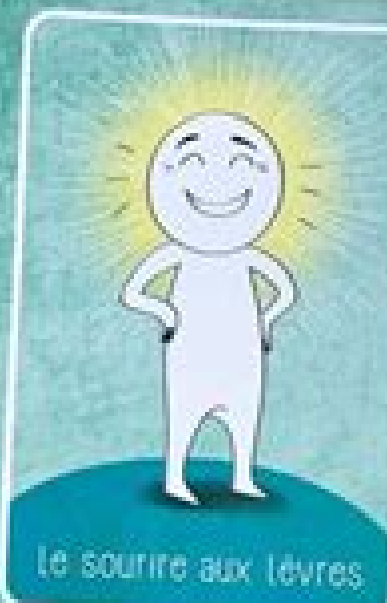
Le sourire aux lèvres