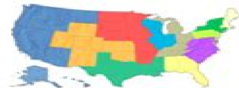
The federal system is divided into 12 districts called circuits.