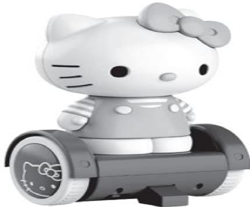
Remote Control Hoverboard