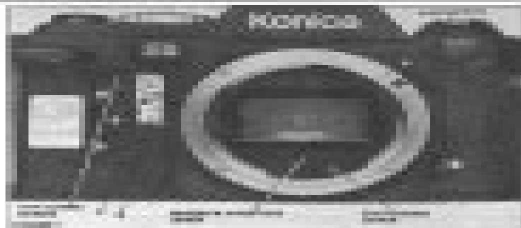
Fig. 21 (approximate)