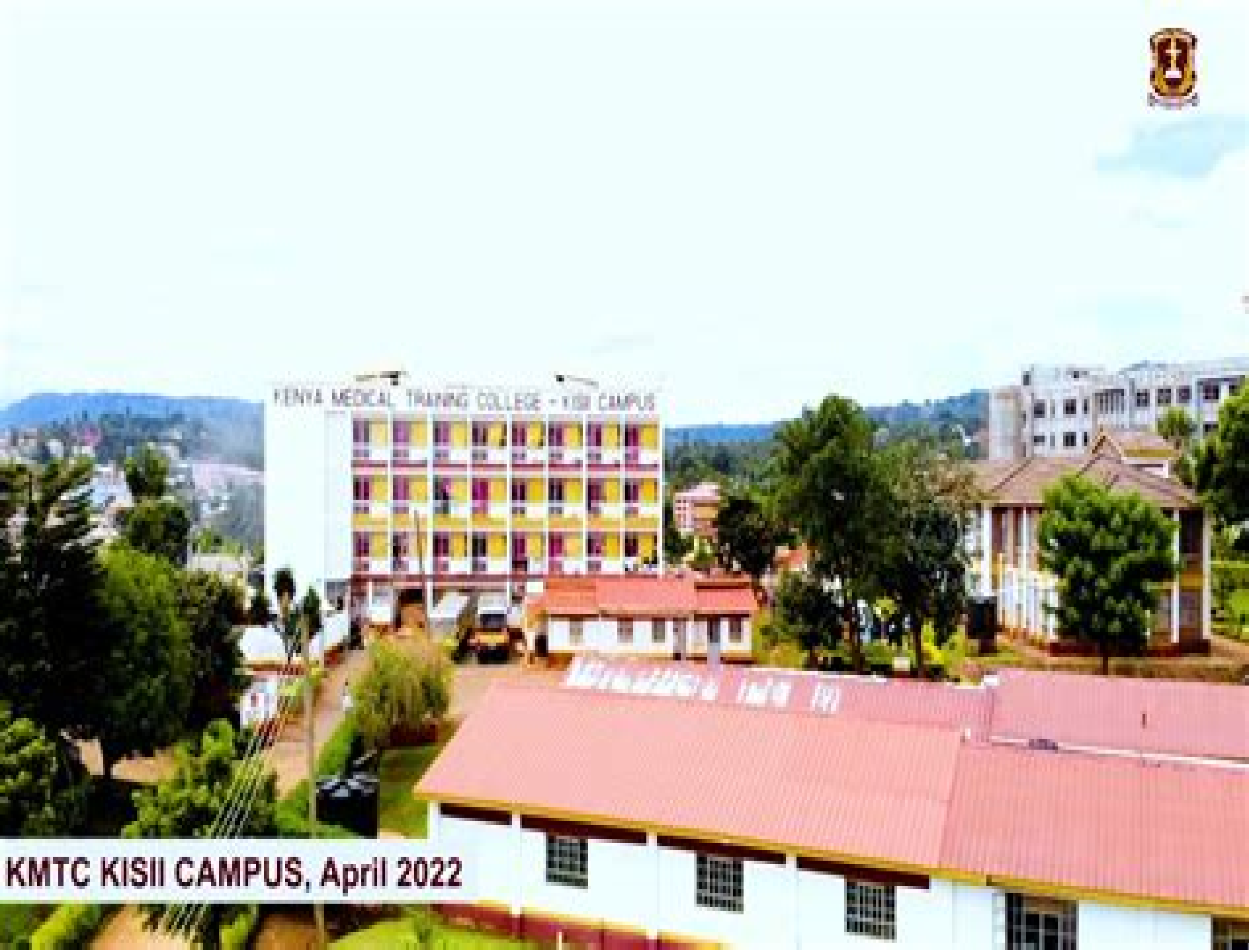
KMTC KISII CAMPUS, April 2022