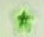
State of Mind in Journal