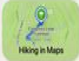
Hiking in Maps