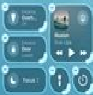
Control Center customization