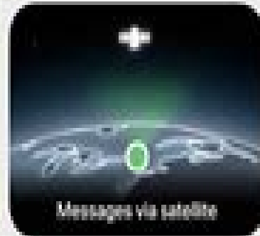
Messages via satellite