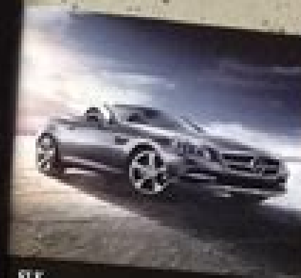
SLK Sport's Road