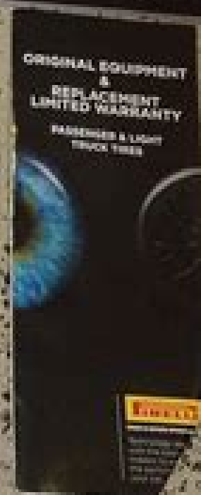
ORIGINAL EQUIPMENT & REPLACEMENT LIMITED WARRANTY PASSENGER & LIGHT TRUCK TIRES