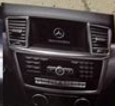
Audio 20 Stereo/Navigation