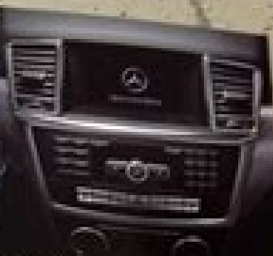
Audio 20 Stereo/Navigation