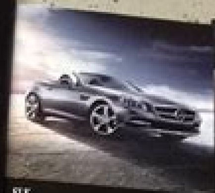
SLK Sport's Road