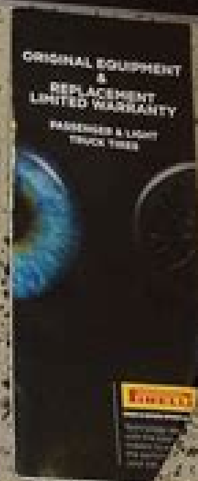
ORIGINAL EQUIPMENT & REPLACEMENT LIMITED WARRANTY PASSENGER & LIGHT TRUCK TYPES