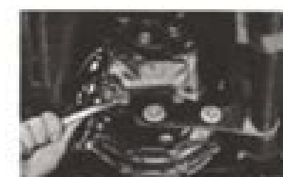
Fig. 4.4 Reporting the column pipe support results on the record page.